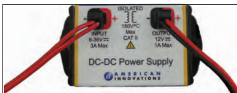
Power Supply Connectors